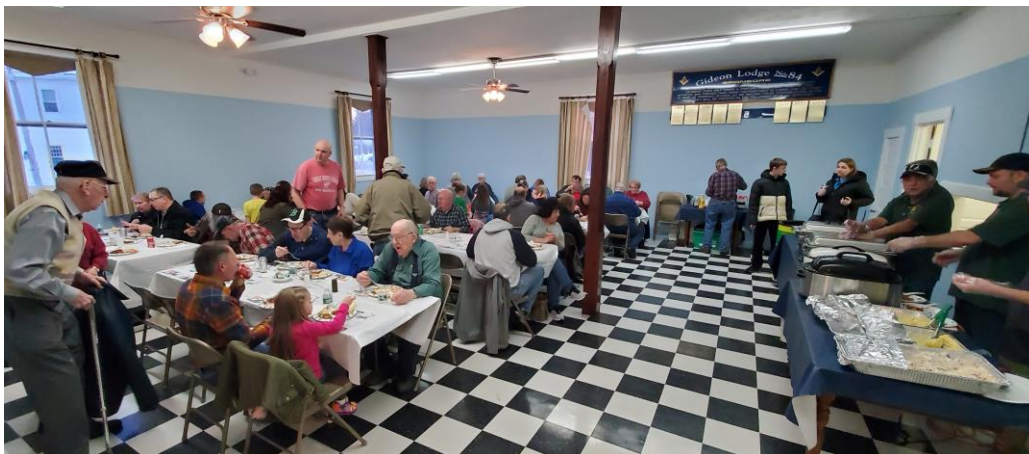
A Packed House at Our Last Ham & Bean Supper

Ritual Rehearsals held at the Lodge at 6pm every Monday are CURRENTLY CANCELLED